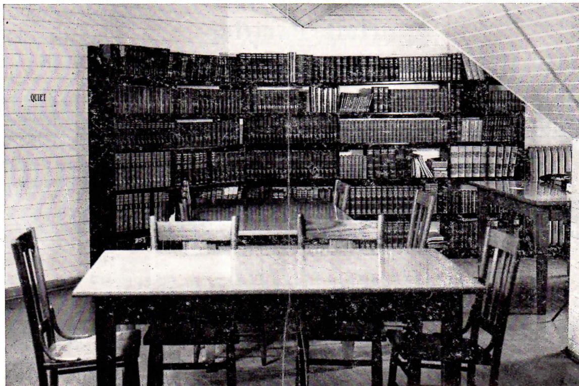
Reference Section of Pacific Bible College Library